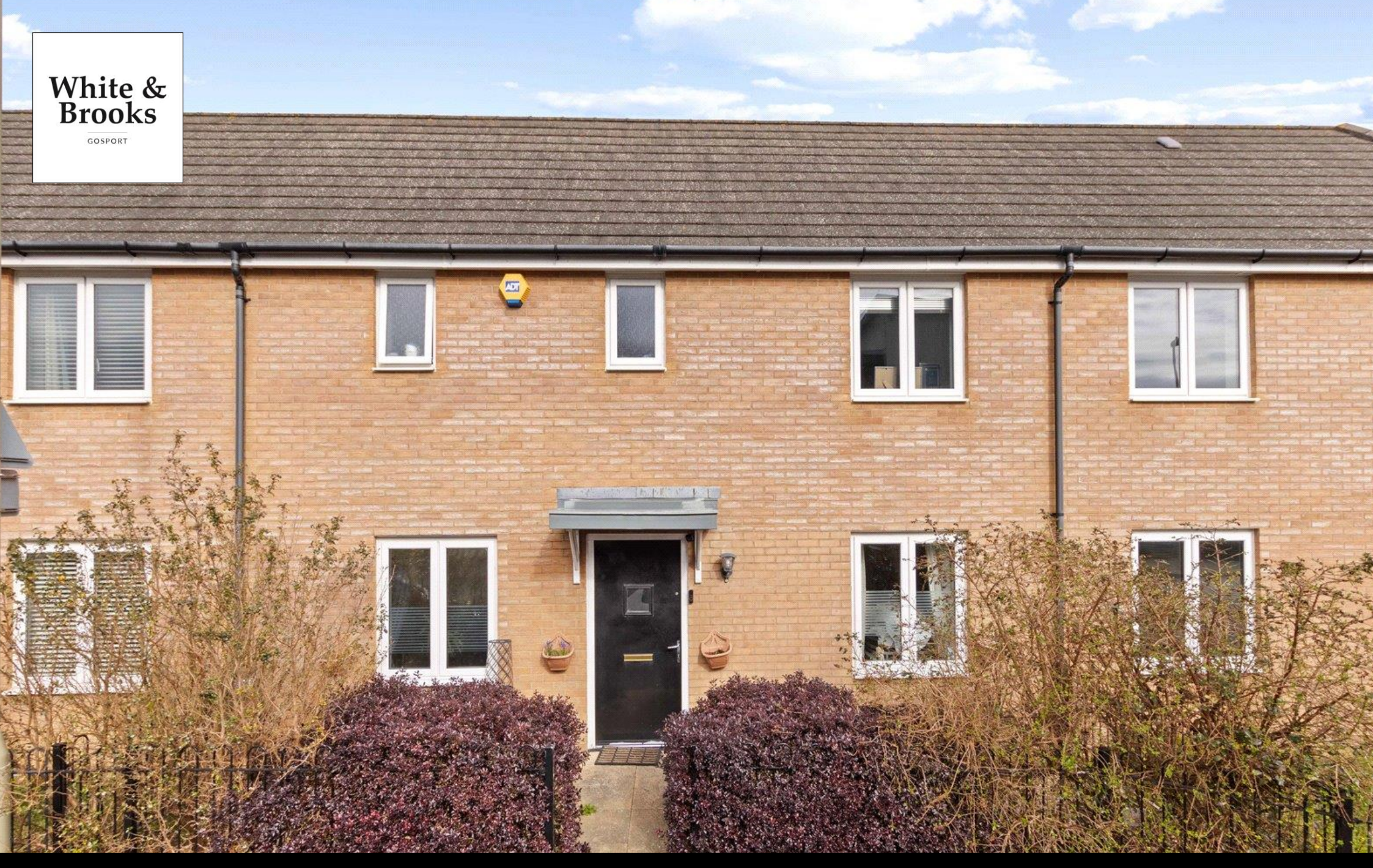
42 Howe Road, Gosport, Hampshire, PO13 8GR